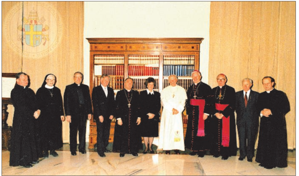
Pope John Paul II and administration of the Foundation

In 1981, the Center for Documentation and Research of the Pontificate of John Paul II was established. Due to the variety of the collected documents three different