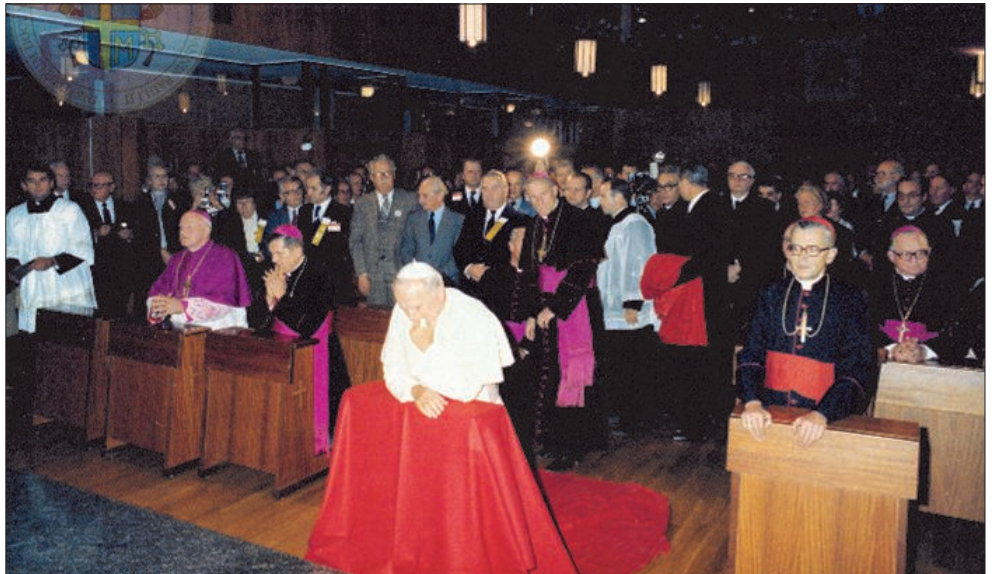
John Paul II in the Polish House in Rome