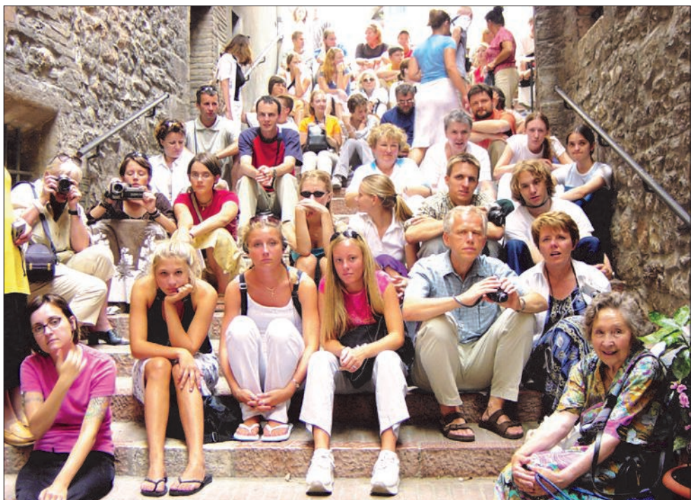
Summer University participants