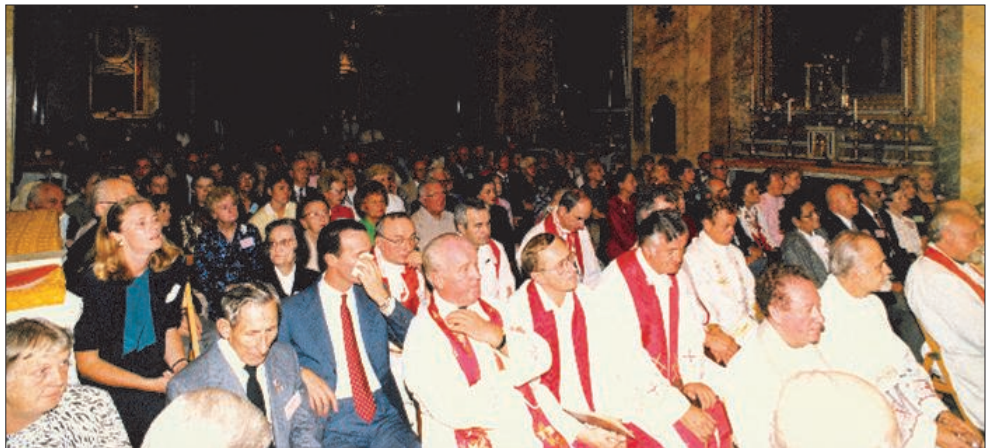
Foundation members in St. Stanislaus B & M church in Rome