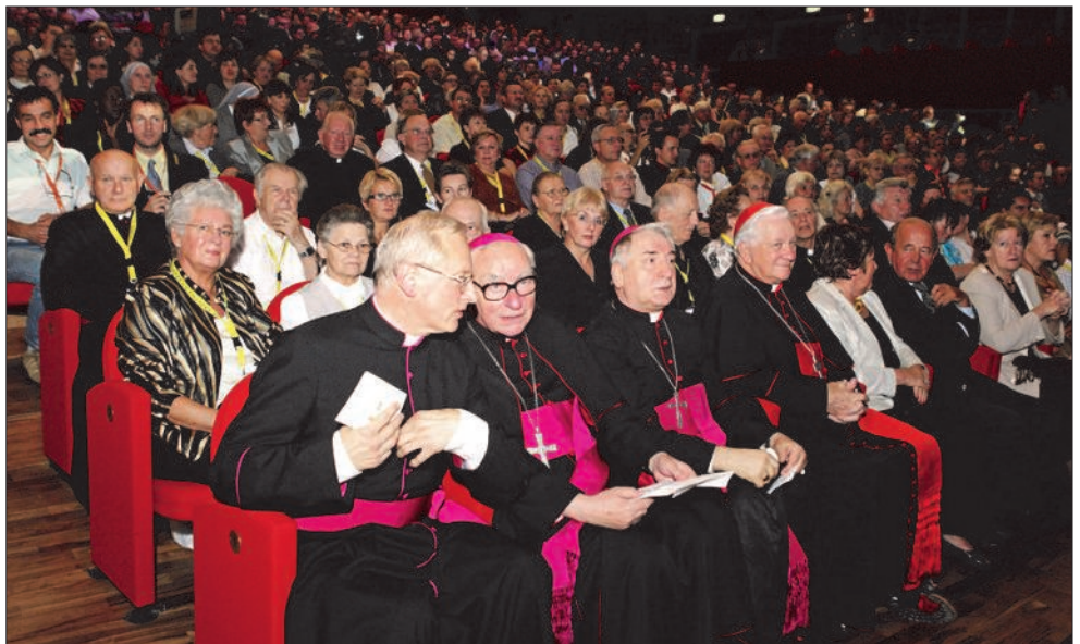
25th Anniversary Concert