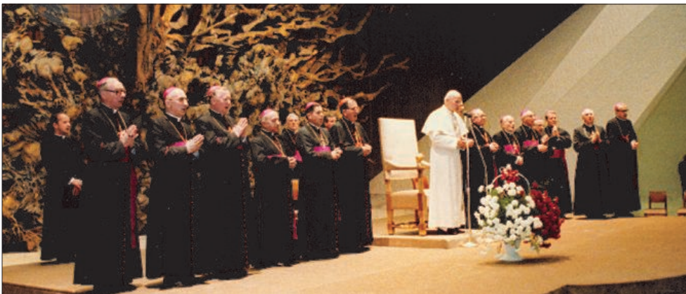
Handing keys of the Polish House in Rome

The Polish Institute of Christian Culture was launched in 1981 with it's main goal of conducting research on the role of Polish culture in Christianity and to support Polish culture in the Eternal City. In 1990 in Lublin, a Laboratory Research section of the Institute was opened. In the Laboratory Research, the role of Polish Christian Culture in the Slavic countries, especially those countries which were included in the former Soviet Union, was analyzed. Scientific and cultural activities of the Institute of