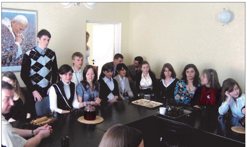
Students in Lublin, Poland